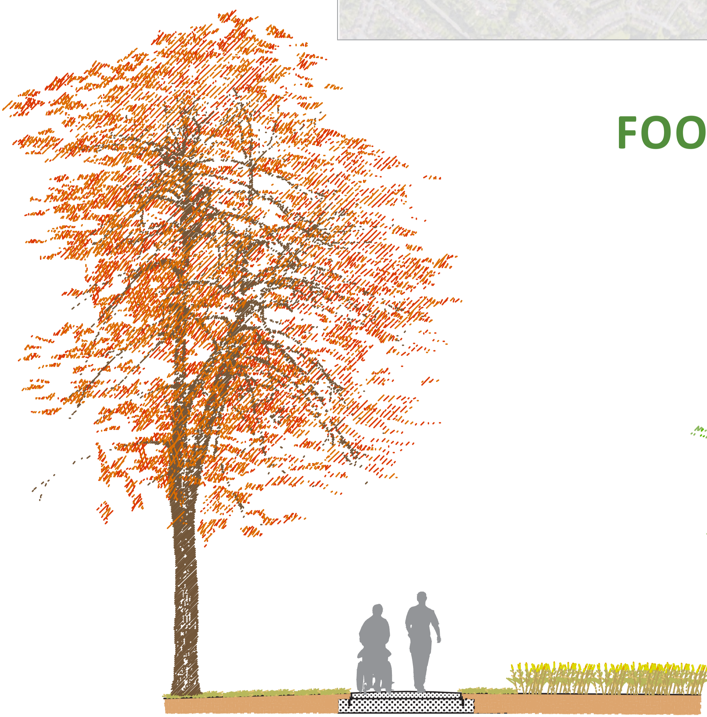
TYPICAL SECTION - SECONDARY ROUTE