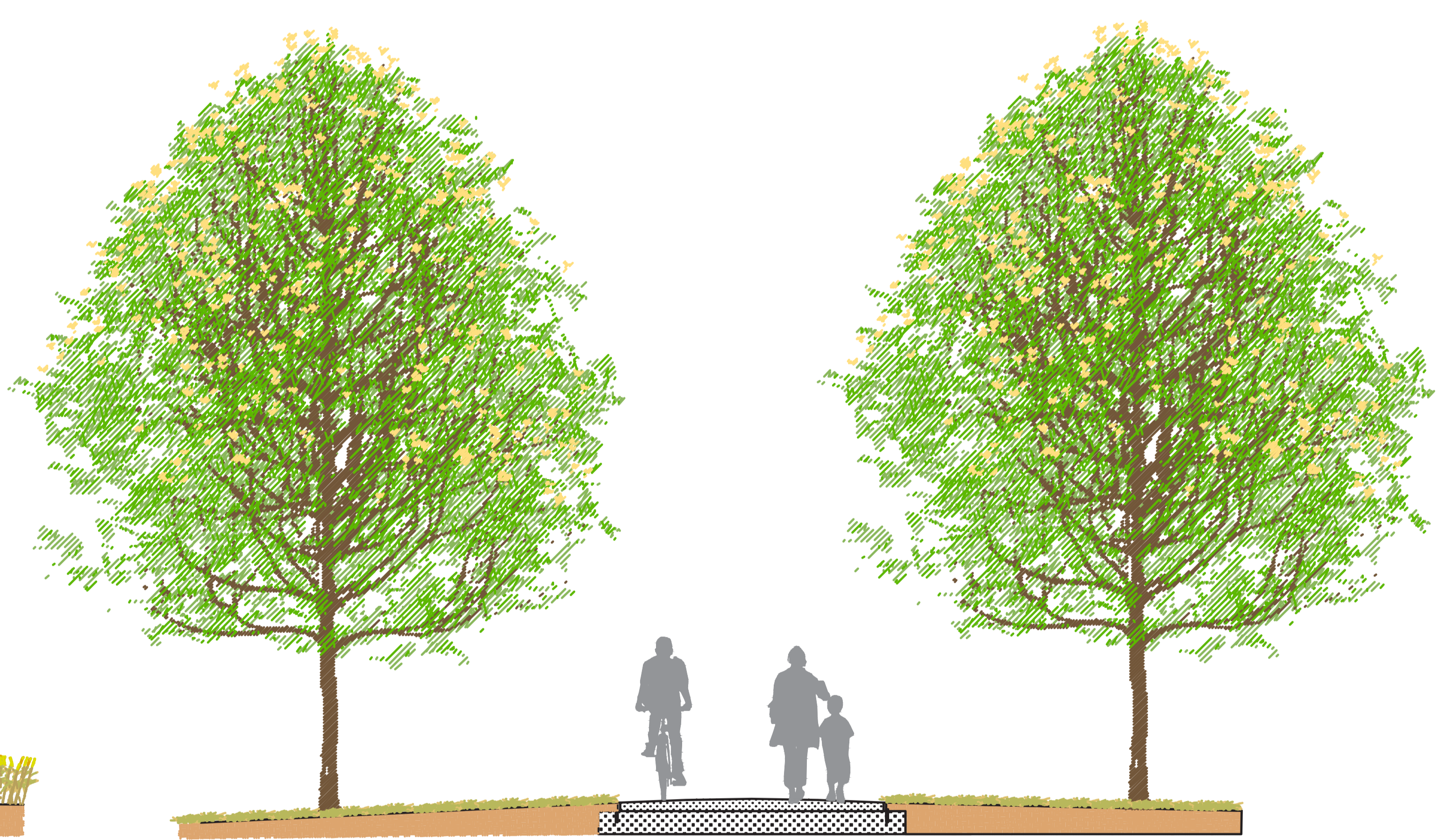
TYPICAL SECTION - PRIMARY ROUTE

Copyright 2022. All details subject to Planning Approval